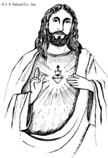
Most Sacred Heart of Jesus

NOVENA / RETREAT: St. Michael's Church invites everyone to the Sacred Heart of Jesus Novena beginning June 7th, at 6:00pm in the chapel, concluding June 15th. The Thanksgiving Mass and Consecration to the Sacred Heart of Jesus will be celebrated on June 16th at 7:00pm in the church. All are welcome.