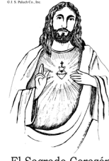
El Sagrado Corazón de Jesús

If you are interested in reserving a space for the yard sale, please visit the parish office to make the payment or call for more information at 973-484-7100.